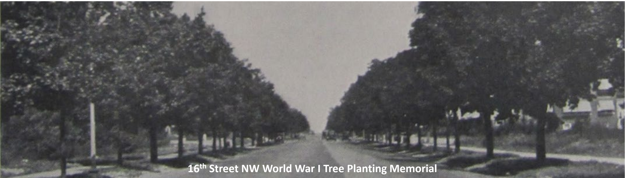
16 th Street NW World War I Tree Planting Memorial