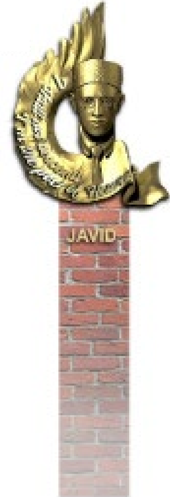
Proposed Bust to the Memory of Huseyn Javid (1882-1941)