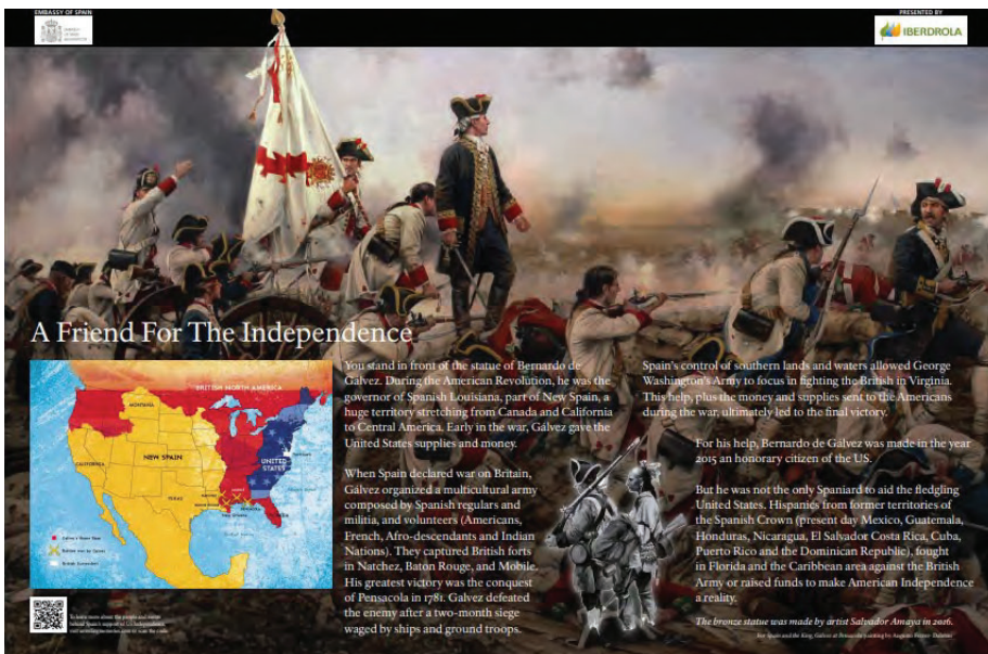
Figure 13. Explanatory sign image