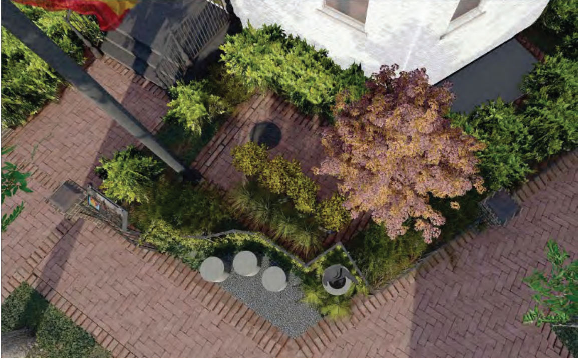
Figure 10. Render aerial view