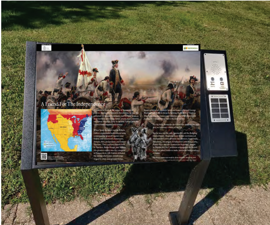
Figure 14. Example of the explanatory sign with the speaker module

The explanatory sign will have a design similar to the National Parks Service. It will have a speaker module and it will provide information about Bernardo de Gálvez in Spanish and English.