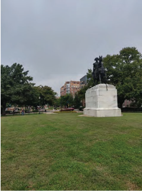
Figure 8. Statue of George Washington, Washington Circle.

The Bernardo de Gálvez statue is small in size (18in x 18in x 39in) and is not meant to compete with or detract from the bronze equestrian statue of George Washington which has dimensions of (9 ft × 14 ft × 6 ft).