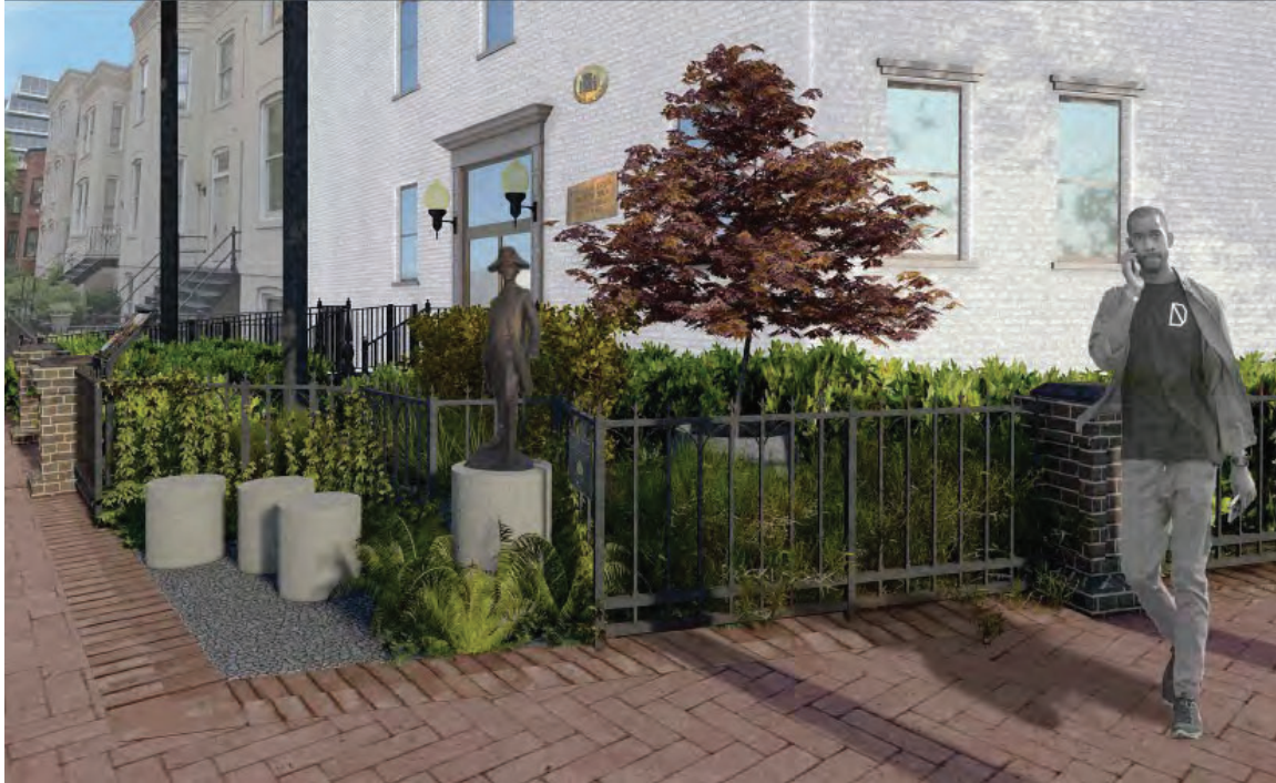
Figure 12. Rendering of the statue, seating area and explanatory sign