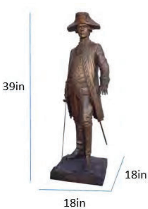
Figure 11. Statue Dimensions